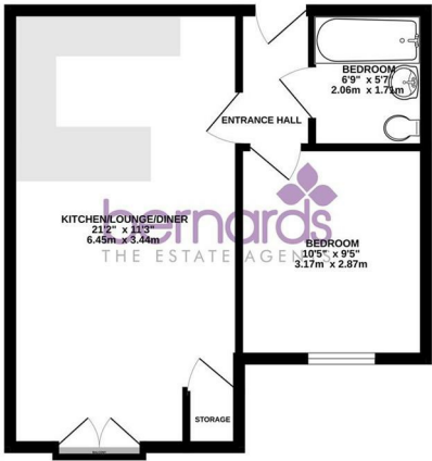
TOTAL FLOOR AREA: 401 sq.ft. (37.2 sq.m.) approx. *All energy ratings have been made to ensure the accuracy of the figures provided here. Measurements of floors, rooms, rooms and other parts of the house are approximate and are not intended to be used for any other purpose. The energy ratings and appliances shown have not been tested and are provided for information only.